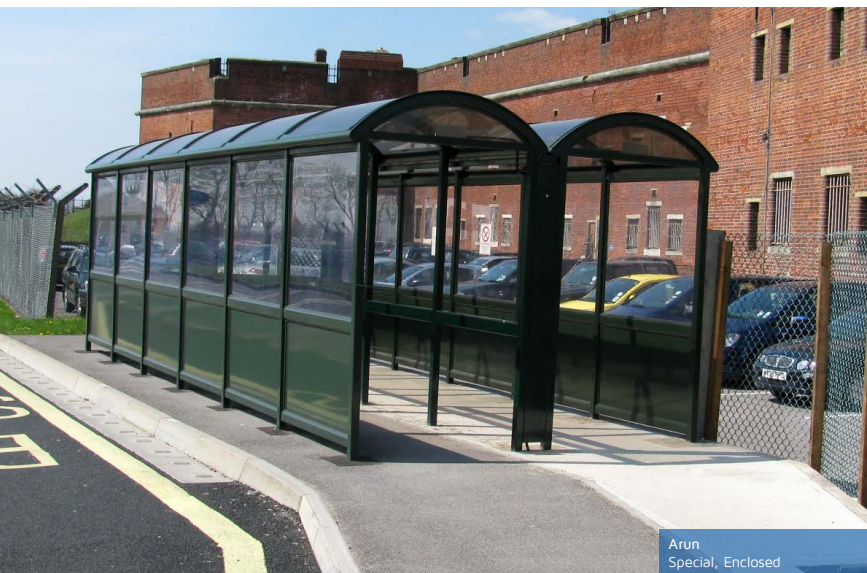
Arun Special, Enclosed