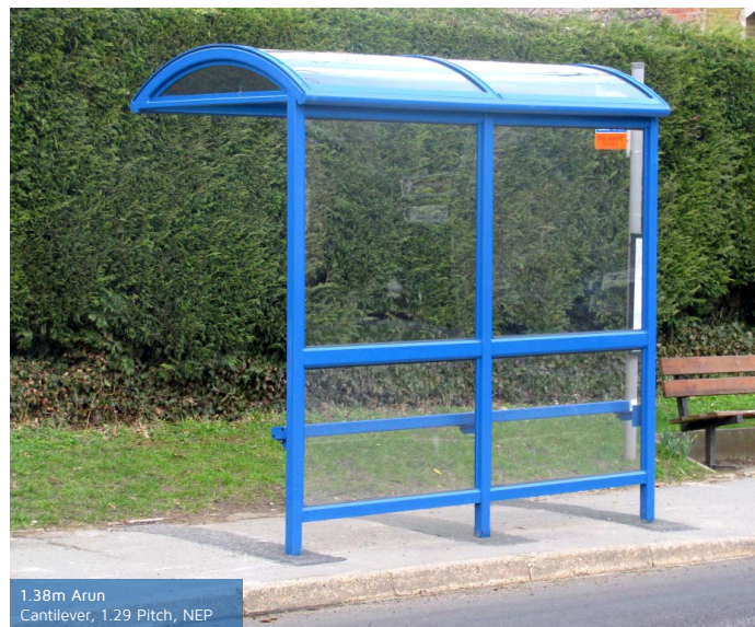
1.38m Arun Cantilever, 1.29 Pitch, NEP