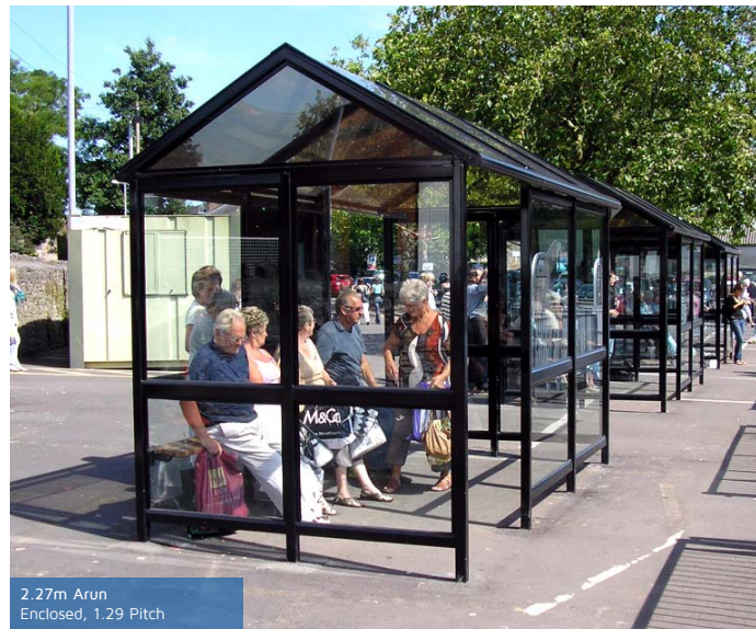
2.27m Arun Enclosed, 1.29 Pitch