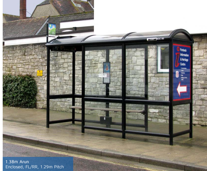
1.38m Arun Enclosed, FL/RR, 1.29m Pitch