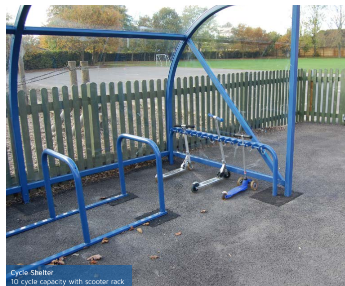
Cycle Shelter 10 cycle capacity with scooter rack