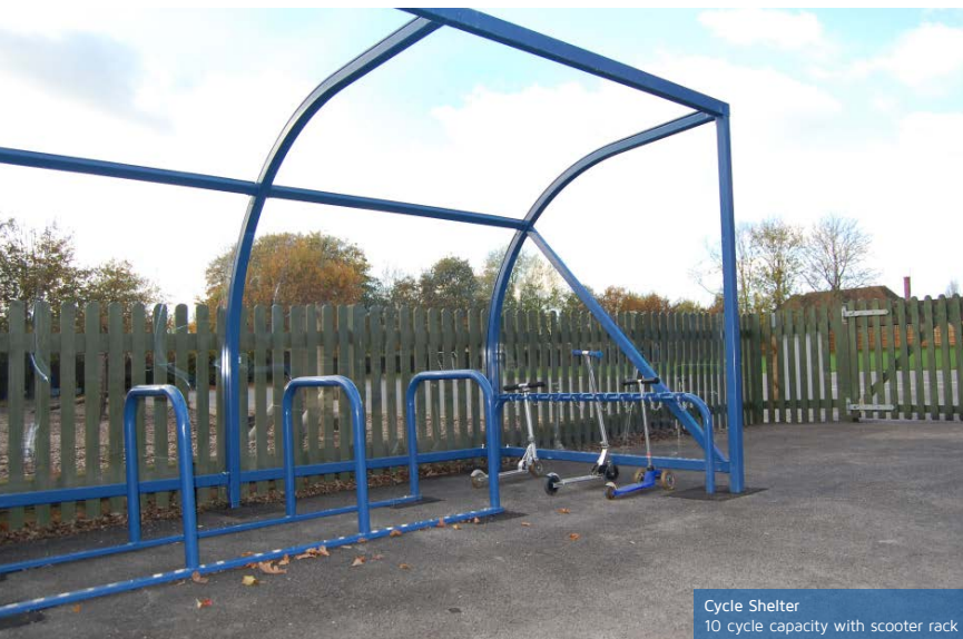
Cycle Shelter 10 cycle capacity with scooter rack