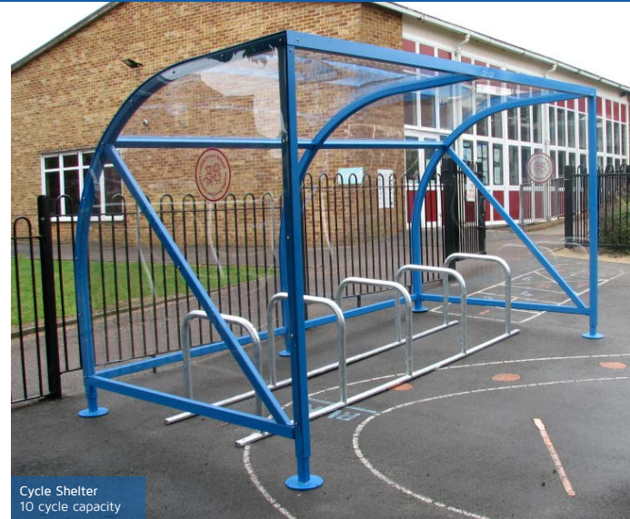
Cycle Shelter 10 cycle capacity

A scooter rack is also available as an accessory or standalone product.