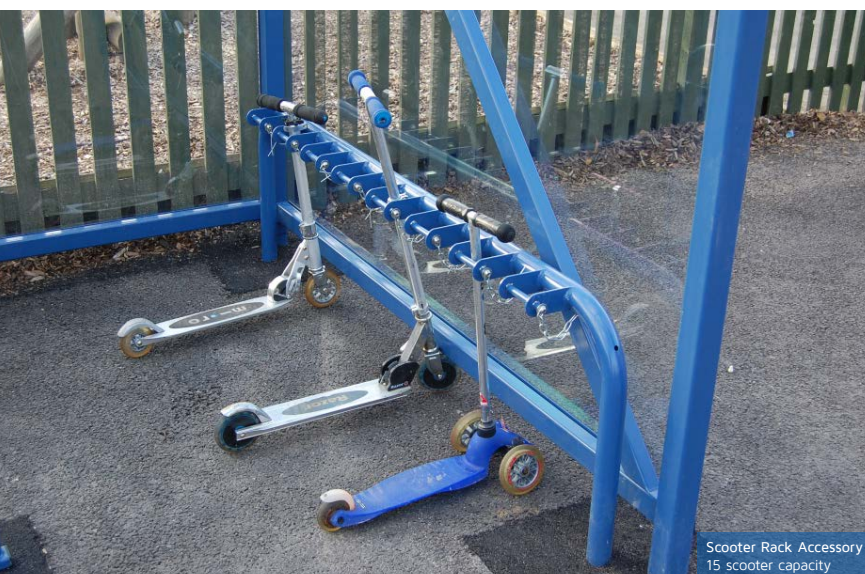
Scooter Rack Accessory 15 scooter capacity