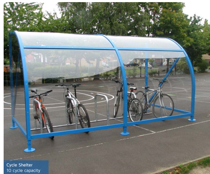
Cycle Shelter 10 cycle capacity