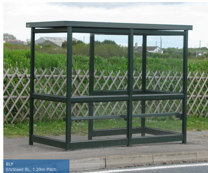
ELY Enclosed RL, 1.29m Pitch