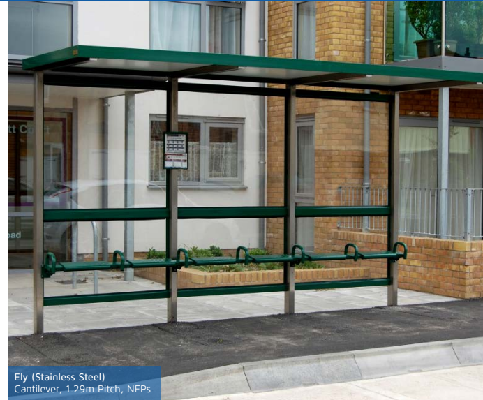
Ely (Stainless Steel) Cantilever, 1.29m Pitch, NEPs

The standard Ely bus shelter is available in 1290mm pitch bays, with a roof width of 1375mm.