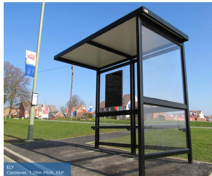
ELY Cantilever, 1.29m Pitch, FEP