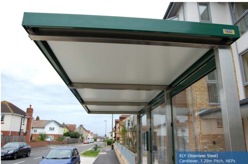
ELY (Stainless Steel) Cantilever, 1.29m Pitch, NEPs