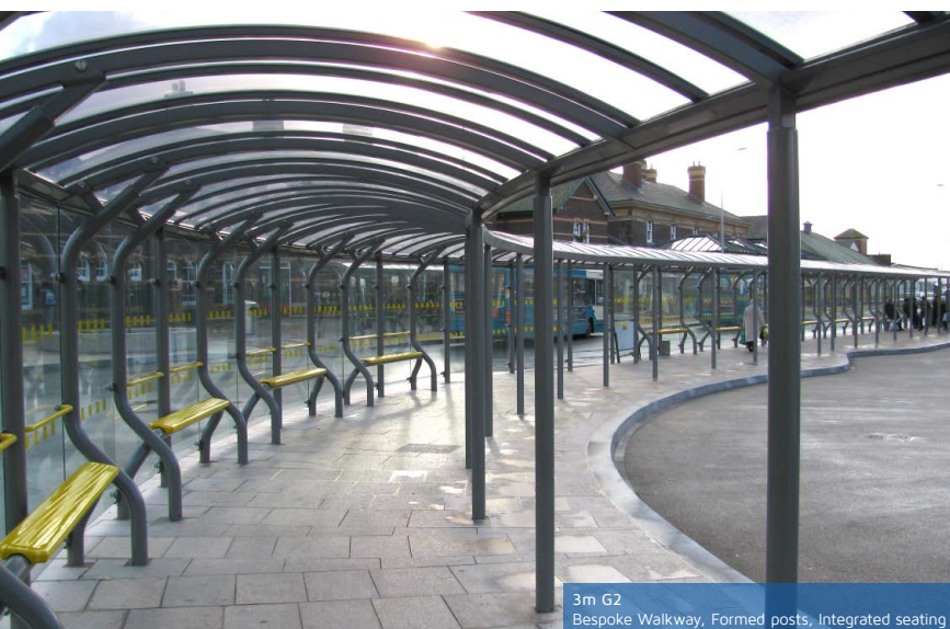
3m G2 Bespoke Walkway, Formed posts, Integrated seating