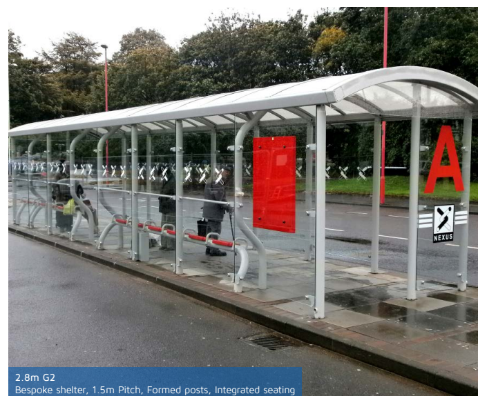
2.8m G2 Bespoke shelter, 1.5m Pitch, Formed posts, Integrated seating