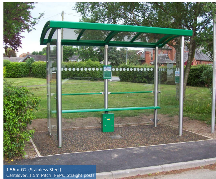
1.56m G2 (Stainless Steel) Cantilever, 1.5m Pitch, FEPs, Straight posts