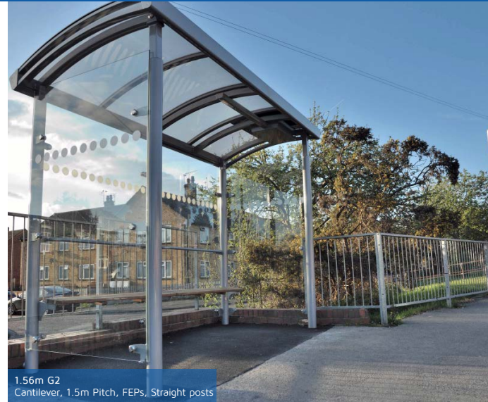
1.56m G2 Cantilever, 1.5m Pitch, FEPs, Straight posts