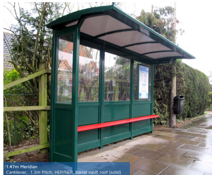
1.47m Meridian Cantilever, 1.3m Pitch, HEP/NEP, Barrel vault roof (solid)