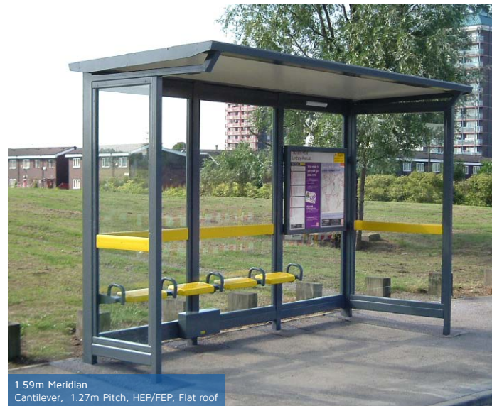
1.59m Meridian Cantilever, 1.27m Pitch, HEP/FEP, Flat roof