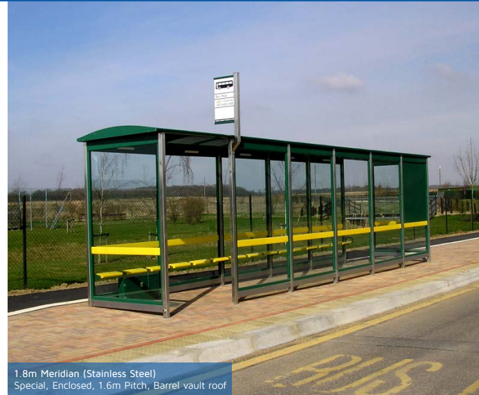
1.8m Meridian (Stainless Steel) Special, Enclosed, 1.6m Pitch, Barrel vault roof