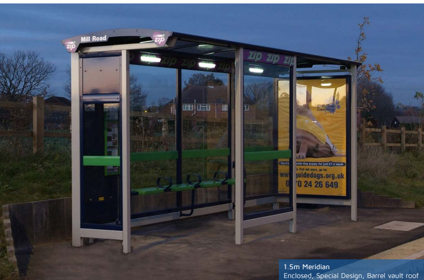
1.5m Meridian Enclosed, Special Design, Barrel vault roof