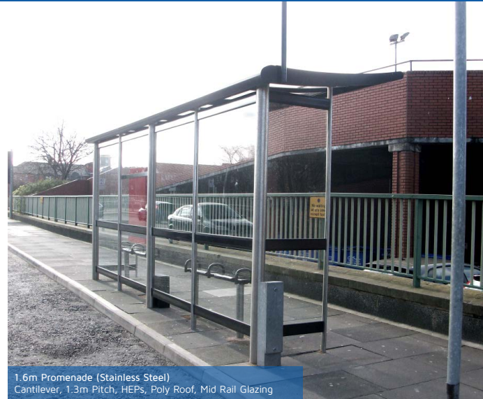
1.6m Promenade (Stainless Steel) Cantilever, 1.3m Pitch, HEPs, Poly Roof, Mid Rail Glazing

The Promenade is available in standard pitches of 1000mm and 1300mm with roof widths of either 1500mm or 1600mm.