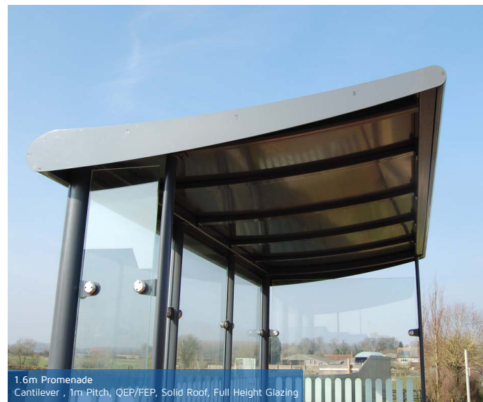
1.6m Promenade Cantilever, 1m Pitch, QEP/FEP, Solid Roof, Full Height Glazing