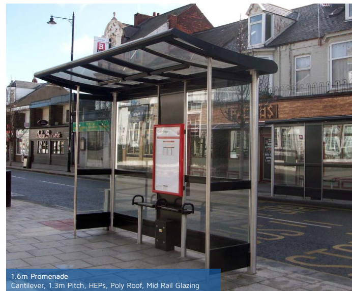
1.6m Promenade Cantilever, 1.3m Pitch, HEPs, Poly Roof, Mid Rail Glazing