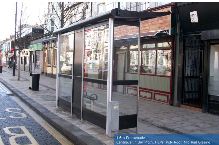
1.6m Promenade Cantilever, 1.3m Pitch, HEPs, Poly Roof, Mid Rail Glazing